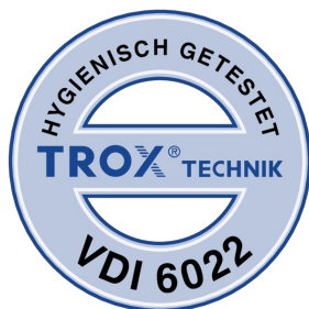
GETEST VOLGENS VDI 6022