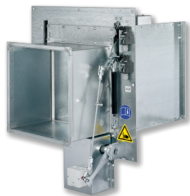
KA-EU MET ELEKTRISCHE OPENLOOPHULP