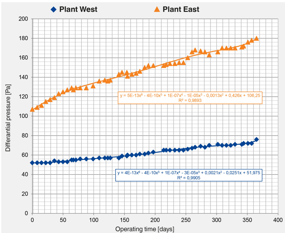
Fig. 1: Graph showing all recorded measurement data

The final measurements at the end of the test showed clear differences: the NanoWave® filter (76 Pa) exhibited a differential pressure of just under 60% compared to the standard filter (180 Pa); the average differential pressure over the running time was 146.9 Pa for the standard filter and just 61.8 Pa for the NanoWave® (cf. Fig. 1).