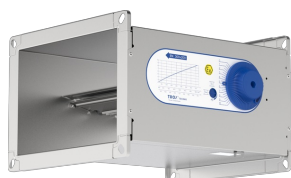
CAV CONTROLLERS TYPE EN-EX